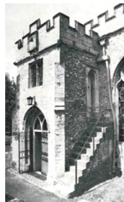
St. Andrews Church, Colyton